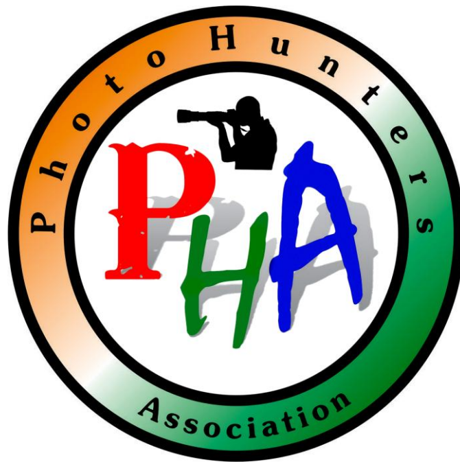
PHOTO HUNTERS PHOTO CONTEST INTERNATIONAL 2017